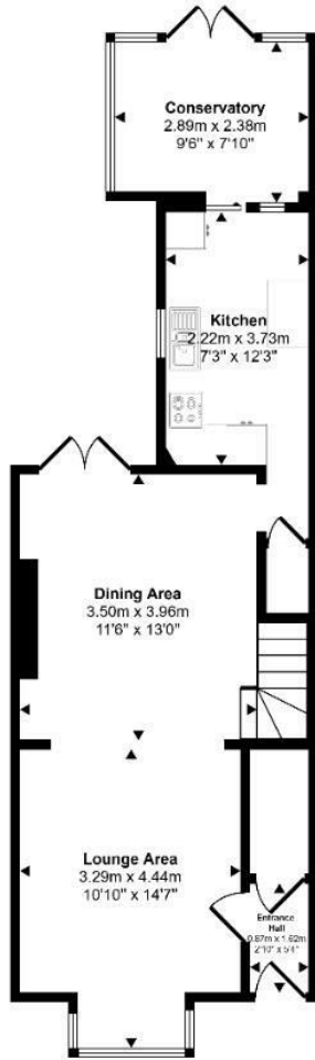
Ground Floor Approx 50 sq m / 537 sq ft